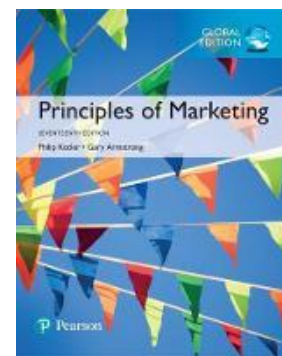
Kotler, Principles of Marketing

You can use your funds to also get stationery, electronic equipment, study skills books and more.