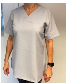
Aesthetic Tunic (light grey)