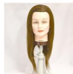
Headfix training head 18"

Your order will be delivered to your residential address. Please provide this at the checkout page.